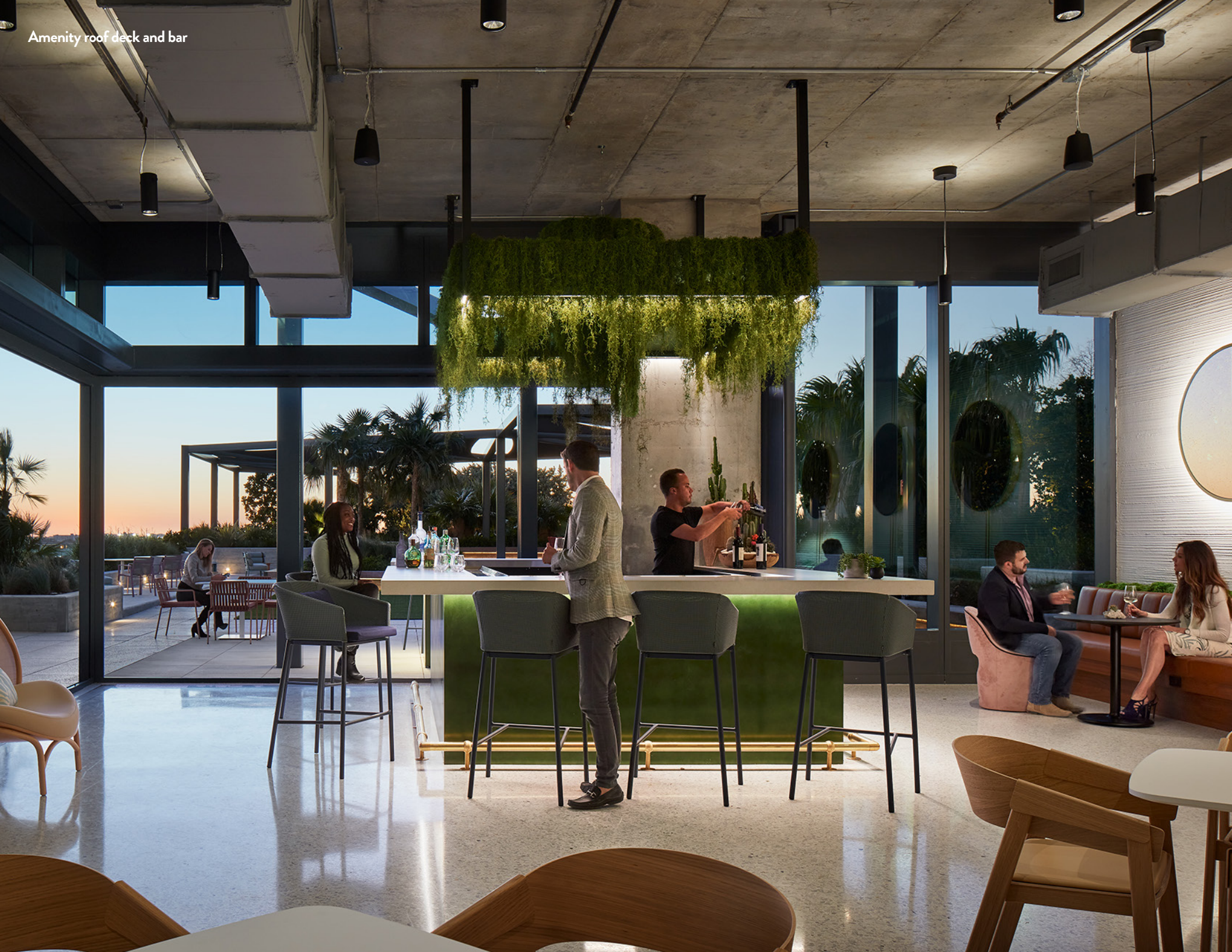
Amenity roof deck and bar