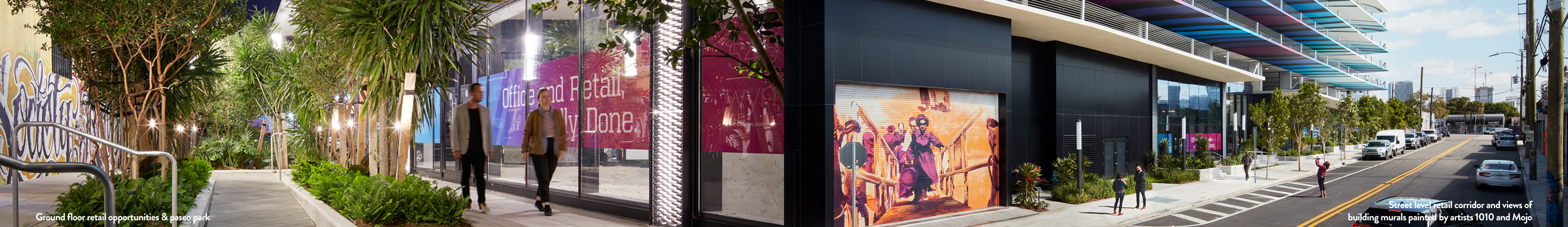
Ground floor retail opportunities & paseo park