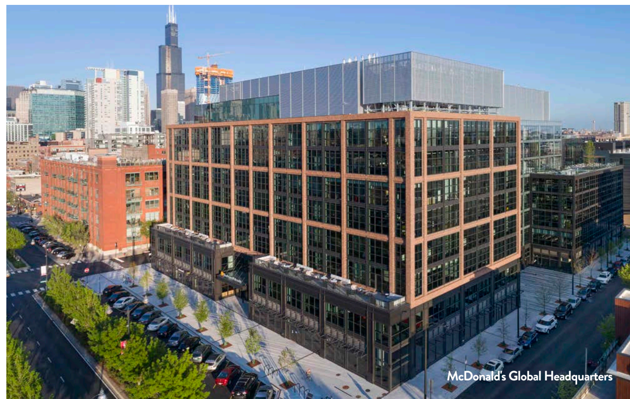
McDonald's Global Headquarters