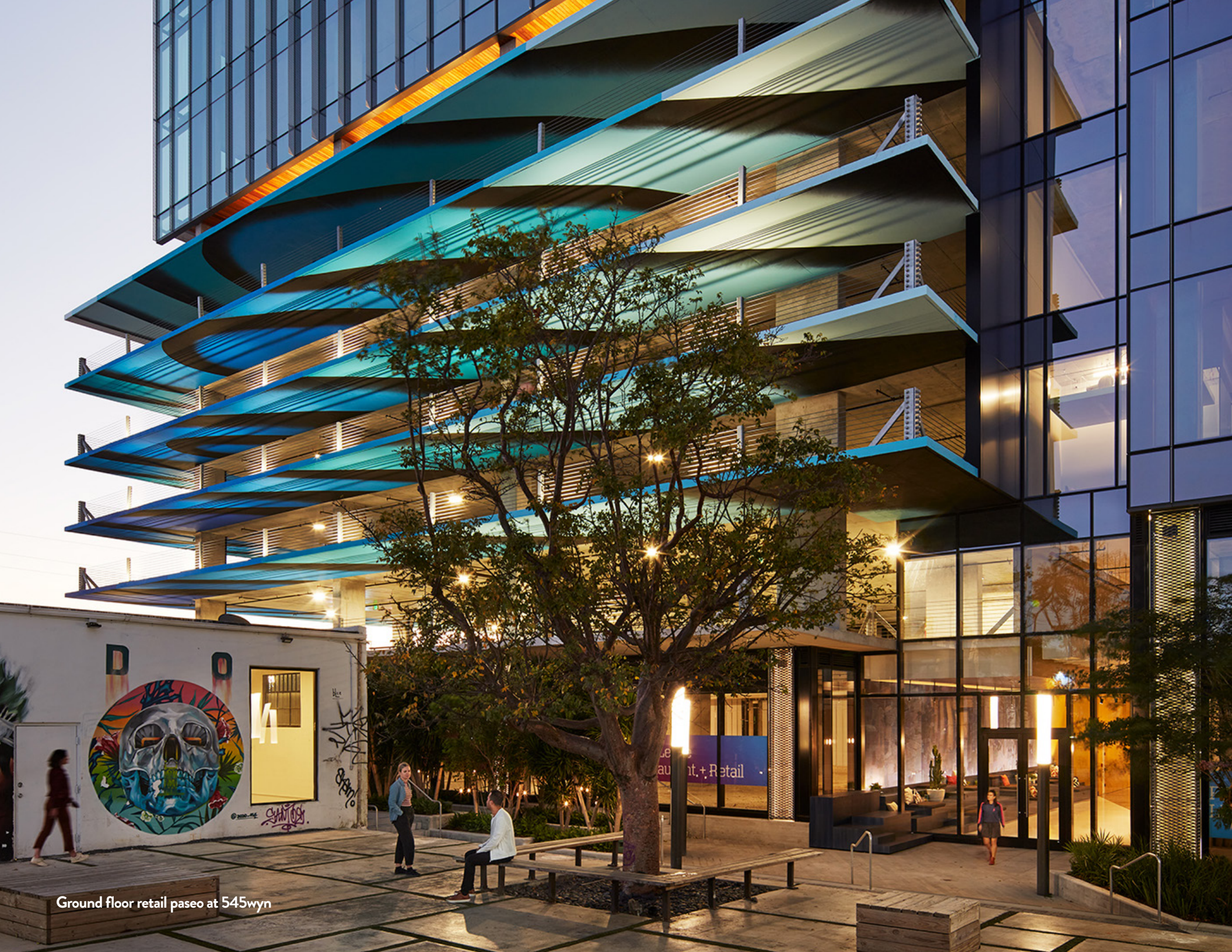
Ground floor retail paseo at 545wyn