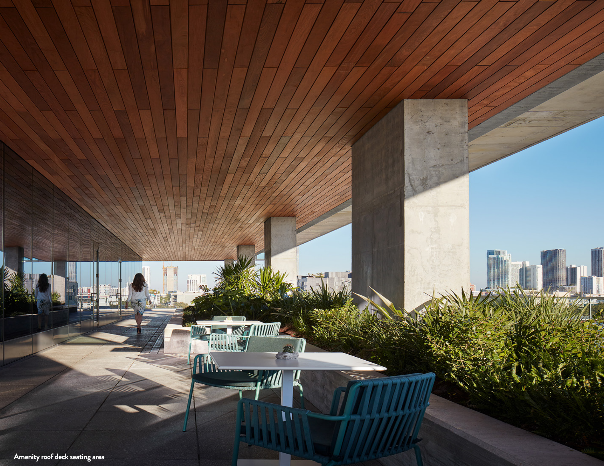
Amenity roof deck seating area