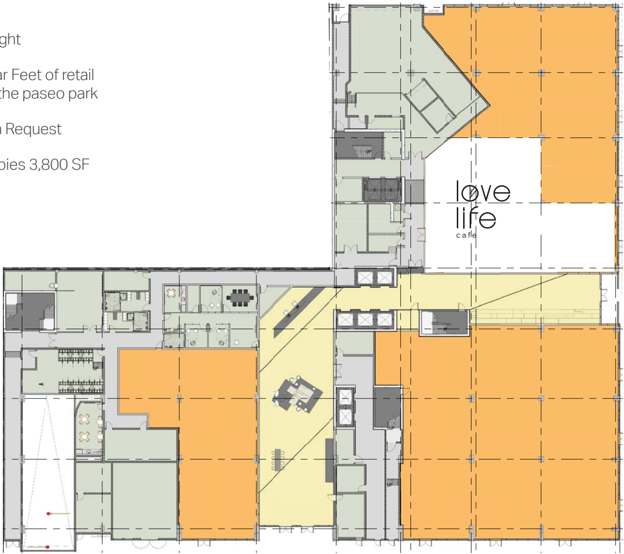
NW 26th Street