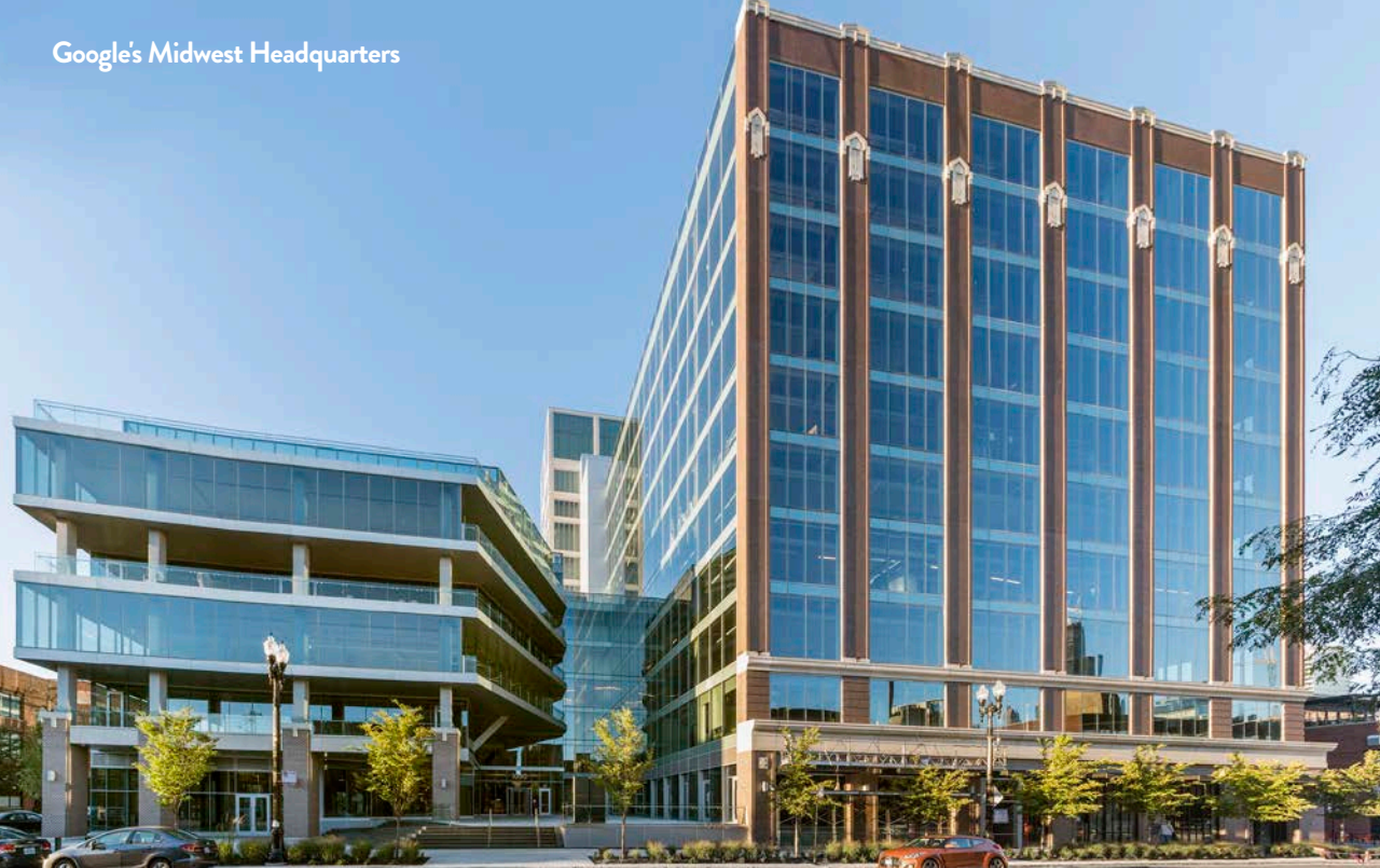
Google's Midwest Headquarters